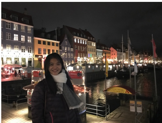
^ Copenhagen - Nyhavn