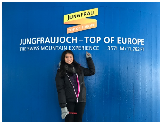
^ Zurich - Jungfrauoch

It was the last month of my exchange semester, as well as the final exams season in NOVA. I had four exams to prepare and they were spread out for about two weeks. I went to school library to study for my exams and after all, I scored good in the exams thankfully. After I had finished my last exam on the 18 th of January, I went to Switzerland and Austria for my last exchange-trip, and back to Lisbon on 23 rd of January to pack my luggage and try again the Portuguese food before I headed back to Hong Kong on the 25 th . I would definitely miss the time here in my 20s! ☺