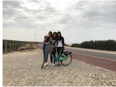
^ Cascais - Cascais Natural Park