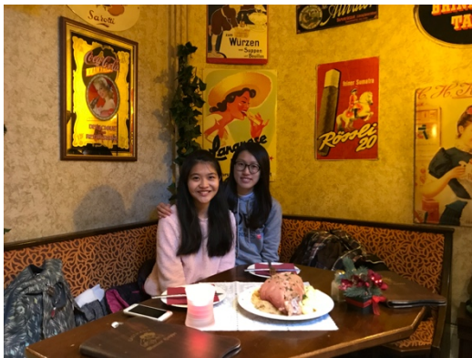
^ Famous German food - Eisbein