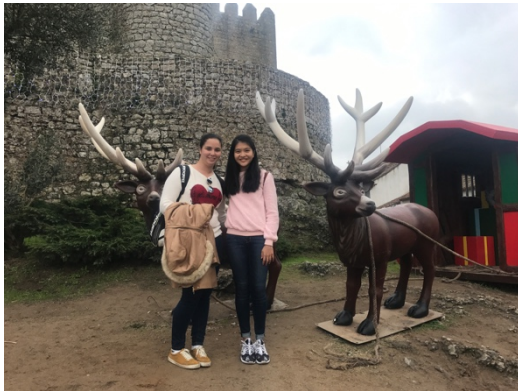
^ Obidos - Santa Claus Village

locals there (haha 😊). After that, I have been to Germany, UK, Denmark, Norway, etc. and travel within the countries, and most importantly I could fly to meet my best friends! It was quite a long trip but time had gone very quickly. It was so unforgettable and exciting that all of the trips were planned by ourselves and what we did were just completely enjoy our lives! I had my trips ended before the last day of the year, and that I could come back Lisbon and celebrate the new year ahead with my friend! It was really my first time celebrating new year overseas, and it had been lit. Yes, really.