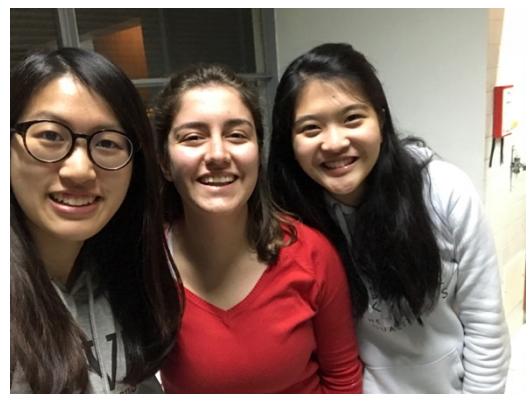
^ Farewell with friend in accommodation