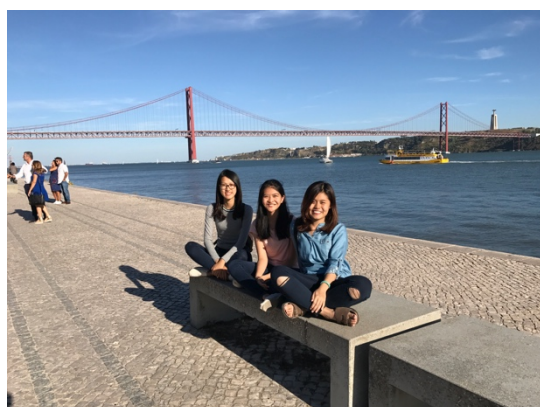
^ Famous Bridge in Belem - Ponte 25 de Abril

Arriving Lisbon on the 6 th of September, I had settled down in Airbnb before I could move in the school accommodation on the 8 th of September since there was a group booking before my check-in date. An orientation day in NOVA was held on the next day of my arrival, I had then joined a membership in the Erasmus Life Lisboa (ELL) which provides a lot of welcoming activities for exchange student over the semester. My friend and I had participated in the welcoming dinner held that day as well. Since the semester started on the 14 th of September, we had approximately a week for us to familiarize ourselves in this wonderful city and to explore those famous attraction districts. During the month, we had been to Belem, Lumiar, Cascais, and many other places, as well as joining different activities held by ELL such as street arts appreciation, etc. because Lisbon has a lot of artistic graffiti around!