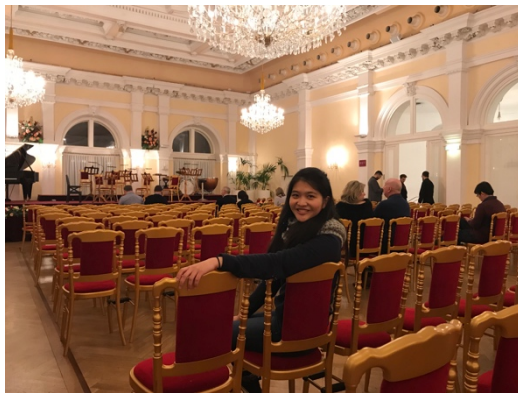
^ Vienna - Classical music concert