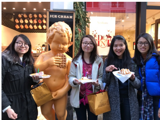
^ Waffles in Brussels

Stepping into the toughest month for students studying in NOVA, there were a lot of projects, assignments and presentations for me to finish. That said, I had still planned to go to Belgium with my friends in HKUST during one of the weekends. We went to Brussels, a place full of waffles and chocolates, it is literally just a heaven for someone who has a sweet tooth like me! The weather was cold already and especially when it compares to Lisbon. It was enjoyable to take a short break and return back to NOVA to prepare for the remaining assignments and presentations.