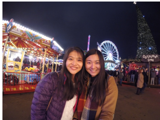
^ London Winter Wonderland