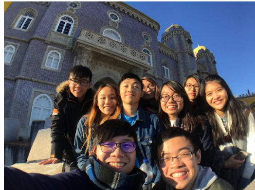
^ Sintra - The Pena Palace