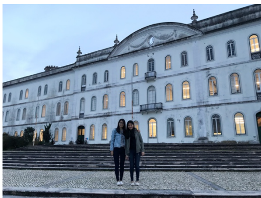
^ NOVA - Last day of school ☺