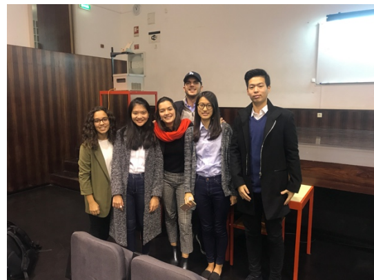
^ Friends in one of my projects