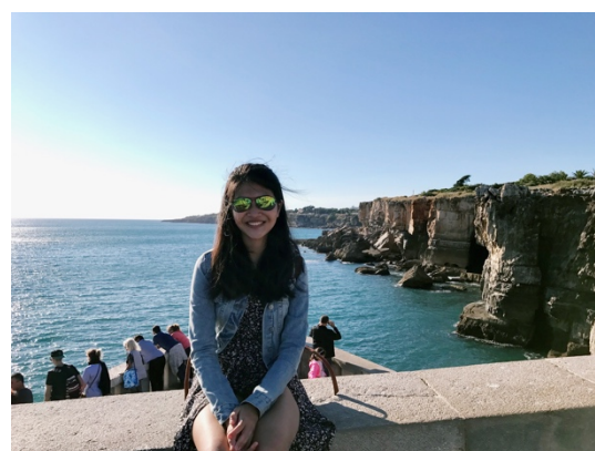
^ Cascais - Boca do Inferno