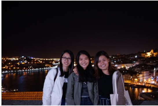
^ Porto - Vila Nova de Gaia