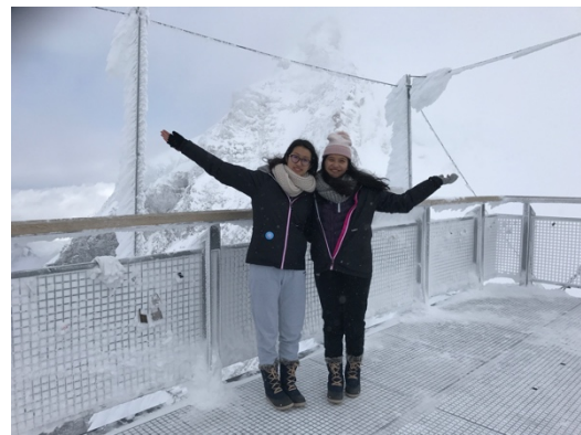
^ Zurich - Jungfrauoch